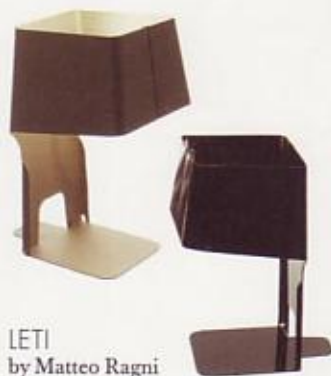
LETI by Matteo Ragni Danese

THERE'S SOMETHING ANTHROPOMORPHIC ABOUT THIS DESK LAMP BY ITALIAN BRAND DANESE; ITS FOLDED METAL FORM ALSO TAPS INTO THE TREND FOR ORIGAMI-LIKE SHAPES. IT'S BRILLIANTLY PRACTICAL, TOO, DOUBLING AS A BOOKEND OR MINI-SHELF